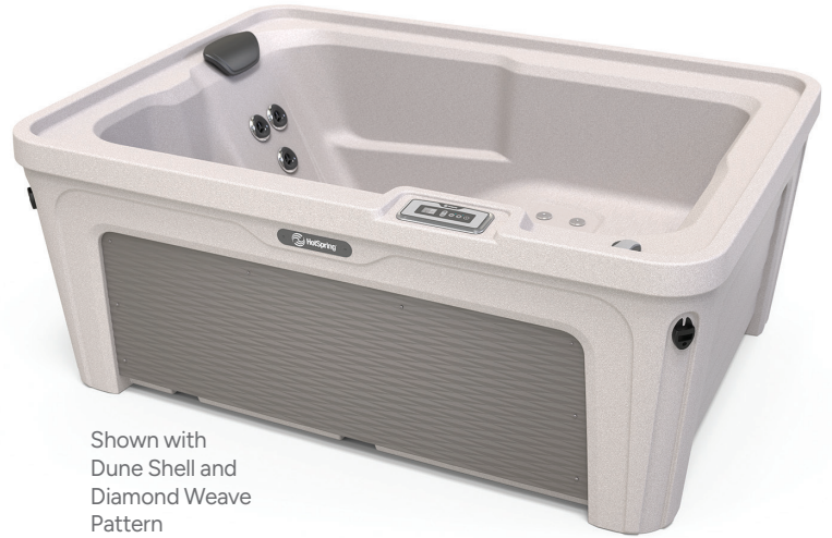
Shown with Dune Shell and Diamond Weave Pattern