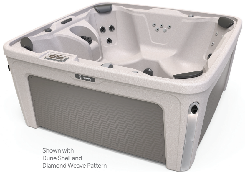
Shown with Dune Shell and Diamond Weave Pattern