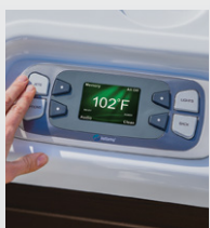
Colour LCD Display