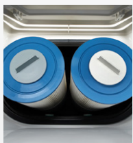
Dual Action Filtration SilentFlo Circulation