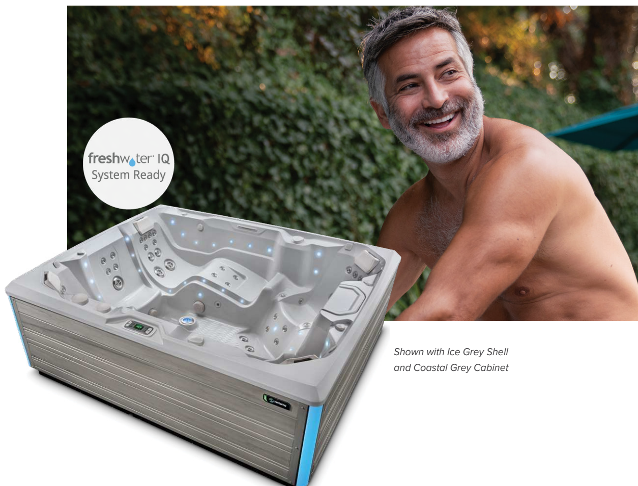
Shown with Ice Grey Shell and Coastal Grey Cabinet