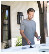
FreshWater® Salt System Ready