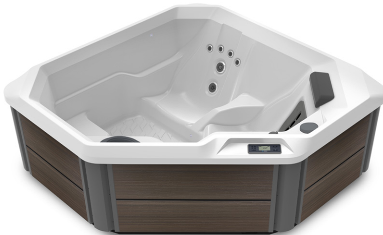
Shown with Alpine White Shell and Havana Cabinet.