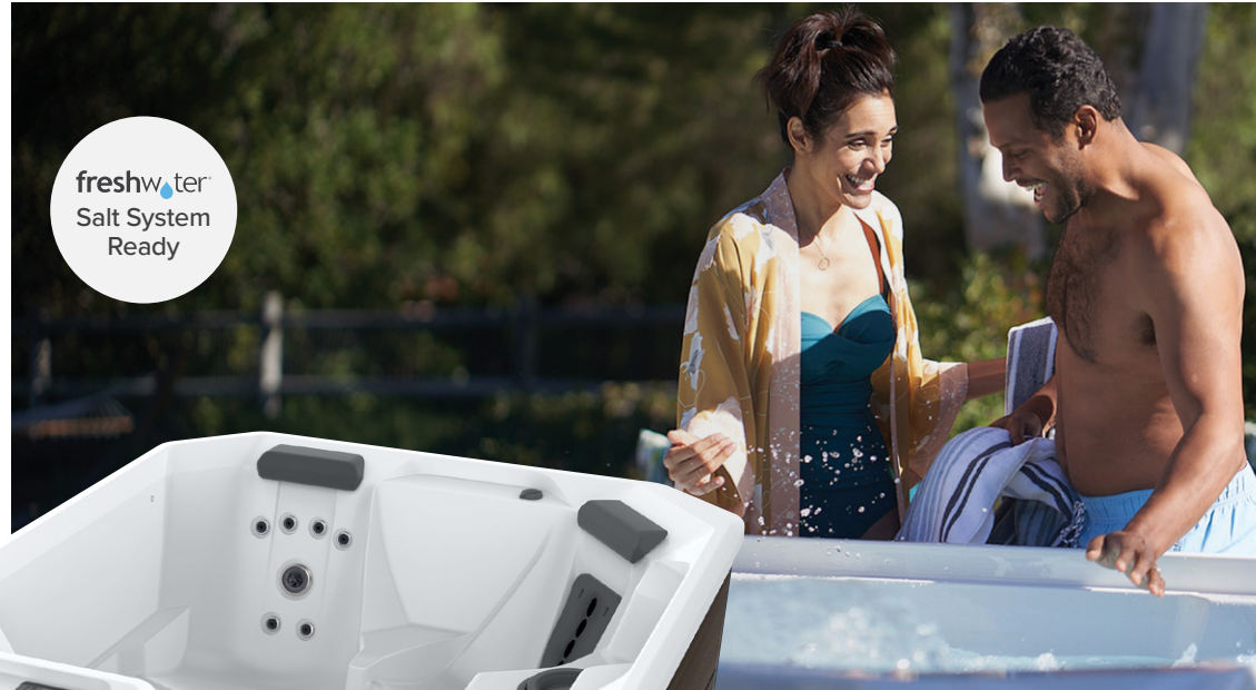
Shown with Alpine White Shell and Havana Cabinet.