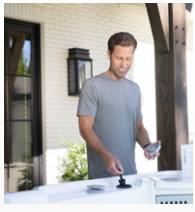
FreshWater® Salt System Ready