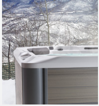
FiberCor® High-Density Insulation