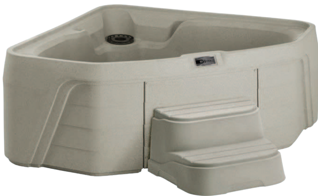
Tristar shown in Sand