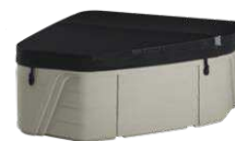
Sand shell with Black cover