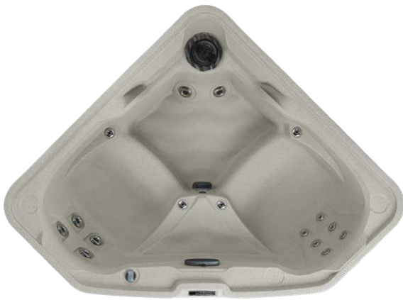
Tristar shown in Sand