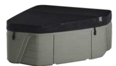
Taupe shell with Black cover