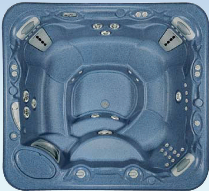
Grandee spa shell shown in Azurite